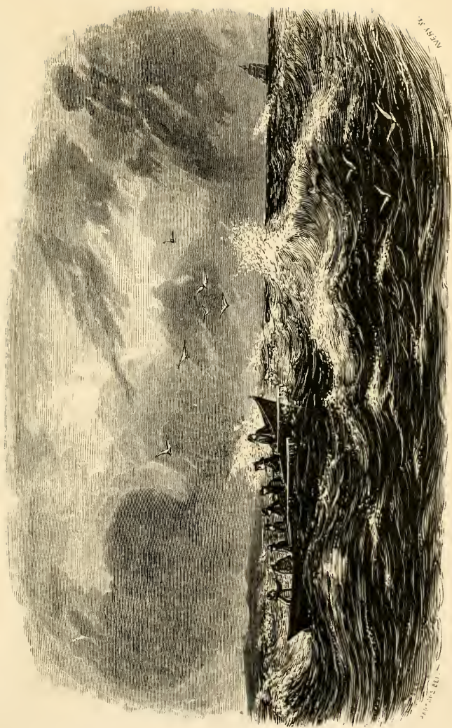
VIEW OF THE FALKLAND ISLANDS. Boat and five passengers pulling after Ship Tonquin.